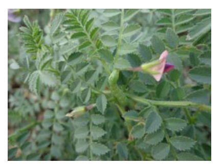
Fig. 1 pod borer affecting chickpea crop.

To break or avoid this long procedure, some decision system need to be design so that easy approach can be use by farmers to solve the issue of detection of pest [3].Conventionally Manual pest monitoring techniques, sticky traps, black light traps are being utilized for pest monitoring[1].